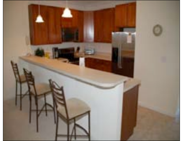
THE GAS FIREPLACE WITH MARBLE SURROUND and HEARTH IS SURE TO KEEP YOU WARM IN THE WINTER MONTHS

THE KITCHEN FEATURES A BREAKFAST BAR, CHERRY CABINETS, STAINLESS STEEL APPLIANCES AND TILE FLOORING