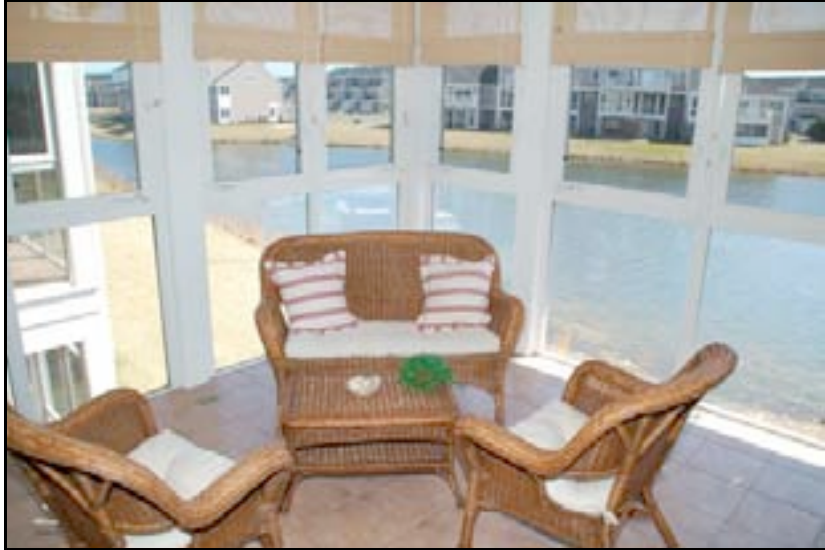
YOUR 3RD FLOOR GUEST BEDROOM HAS A SUNDECK. WITH VIEWS OF THE LITTLE ASSAWOMAN BAY...GREAT SUNSETS

YOUR FLORIDA ROOM FEATURES TILE FLOORING and CASEMENT WINDOWS...GREAT VIEWS OF THE BAY, LAKES and POOL COMPLEX