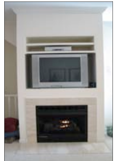
THE COMMUNITY POOL, FITNESS CENTER AND PLAYGROUND ARE WITHIN AN EASY WALKING DISTANCE FROM YOUR UNIT