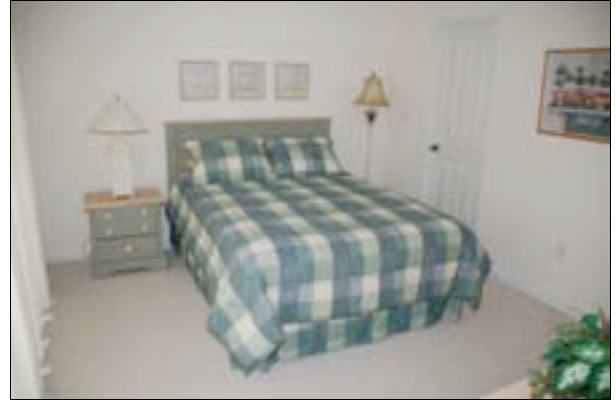
YOUR MASTER SITTING AREA...GREAT FOR A STUDY

YOUR MASTER BATH FEATURES TWIN VANITIES, SOAKING TUB, SHOWER, TILE FLOORING and WALK-IN CLOSET