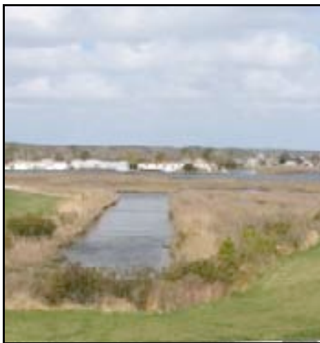
AN EXTERIOR VIEW OF YOUR BUILDING. YOUR UNIT INCLUDES LOW MAINTENANCE CEMPLANK EXTERIOR PLANKING, TWO ENTRIES, DRAMATIC EXTERIOR STAIRCASE, ONE CAR GARAGE W/ OPENER and THREE FABULOUS DECKS/PATIOS ...SUNRISE, SUNSET, NO WORRIES

#1189 BAYVISTA DRIVE BAYVILLE SHORES WEST FENWICK ISLAND, DE