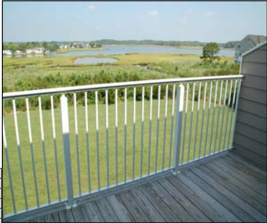
UNIT 1251 BAYVILLE SHORES

RE/MAX Realty Group 317 REHOBOTH AVENUE Rehoboth Beach, DE 19971 MAIN OFFICE TEL: 302-227-4800 DIRECT TEL: 302-436-7591