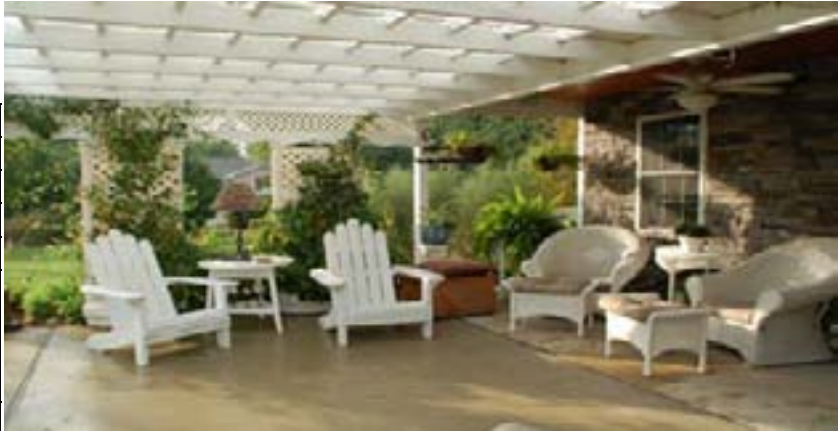
ABOVE **YOUR BACKYARD OASIS**