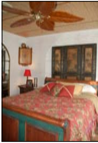
ABOVE, YOUR MASTER BEDROOM