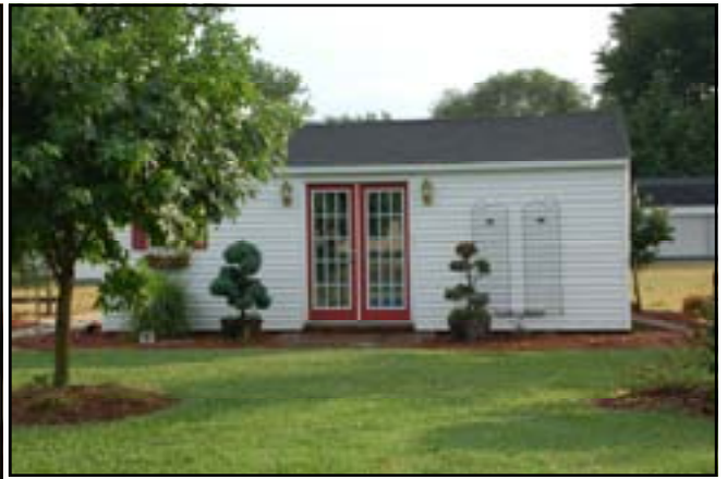
ABOVE, YOUR 12' X 24' OUTSIDE STORAGE SHED... NOW THAT IS A STORAGE SHED!