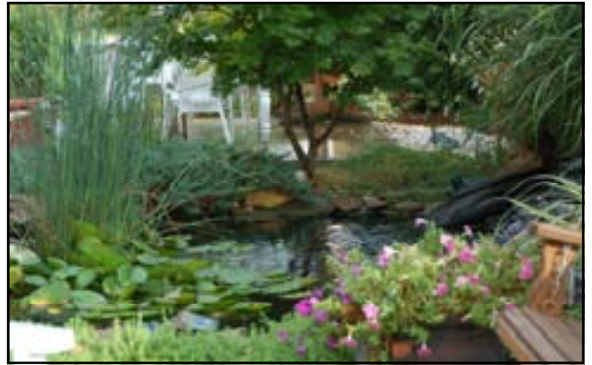
ABOVE AND LEFT, YOUR FISH POND AND ADJACENT BOARDWALK. RIGHT, YOUR OUTSIDE SHOWER