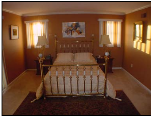
YOUR LIVING ROOM OFFERS TIMELESS BEAUTY, GAS FIREPLACE AND WATER AND WETLAND VIEWS