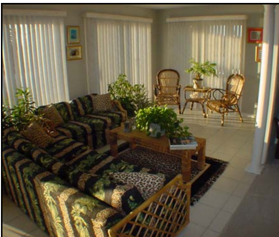
YOUR FLORIDA ROOM...BRIGHT AND CHEERY SPACE WITH MAGNIFICENT VIEWS