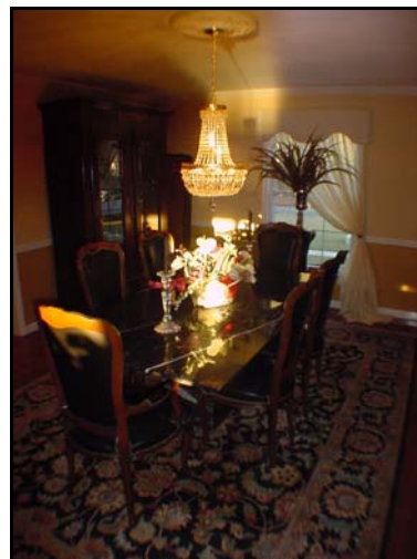
YOUR FORMAL DINING ROOM INCLUDES BUILT-INS FOR YOUR ACCOUTREMENTS