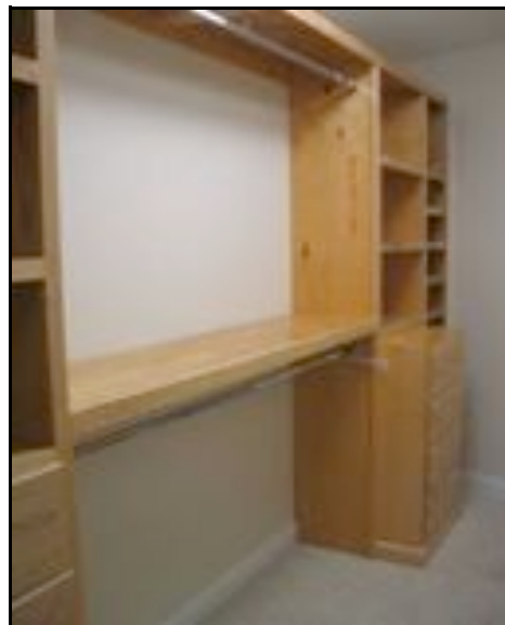
TYPICAL CUSTOM CLOSET SYSTEM