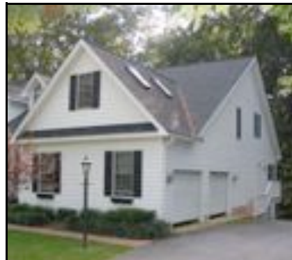
THE EAST SIDE OF YOUR HOME OFFERS TWO CAR GARAGE, ACCESS TO THE KITCHEN AREA AND BASEMENT STORAGE SPACE AND TWIN SKYLIGHTS HIGHLIGHTING A 2ND FLOOR GUEST BEDROOM