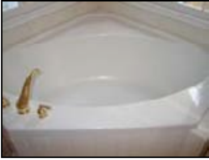
YOUR MASTER BATH SOAKING TUB