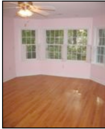
LEFT, THIS GUEST BEDROOM FEATURES HARDWOOD FLOORS, AMPLE WINDOWS AND ITS OWN PRIVATE BATH!