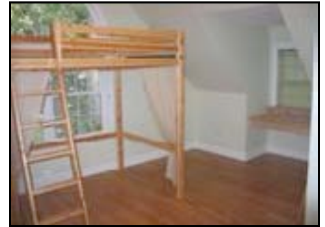
A TYPICAL GUEST BEDROOM...LIGHT, SPACIOUS WITH PLENTY OF BUILT-INS. WALL ANGLES MAKE EVERY BEDROOM SPECIAL